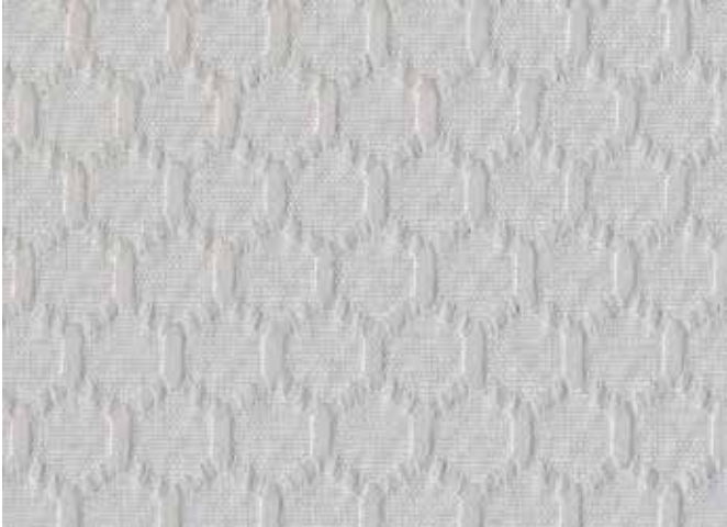
ES-05 Red Jasper