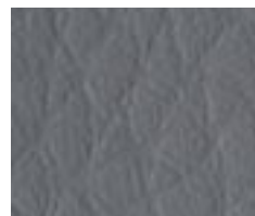
ATX627HG Smoke Stone