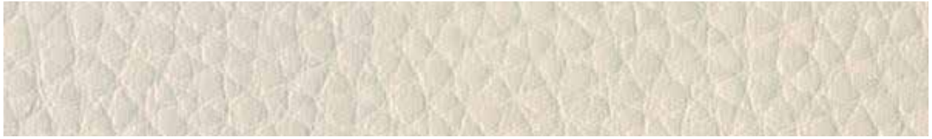
ATX600HG Antique White