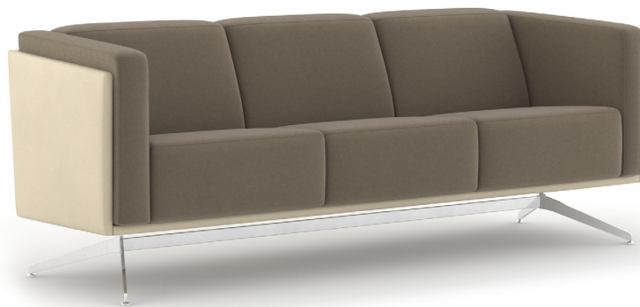
750-3 Three Seat Sofa