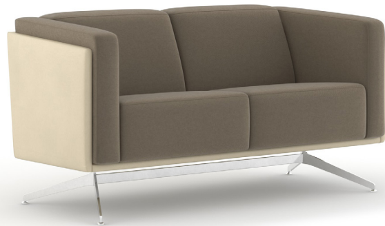
750-2 Two Seat Sofa